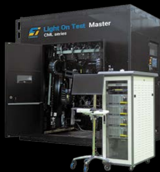
Light On Test Master