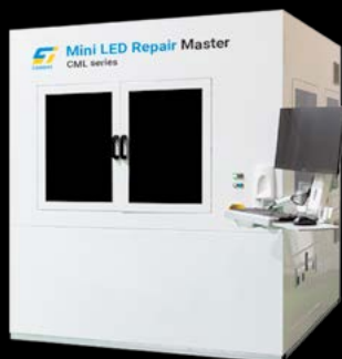
Mini LED Repair Master